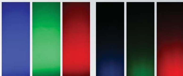
Color Force Output

The new Chroma-Q™ Color Force™ LED batten range is a brute of a light. The super bright fixture easily washes up to 8m / 26 ft. In addition, our advanced ColorSure™ RGBA colour and control management technologies together give you a radically increased colour palette, enhanced colour consistency, a high CRI of 92 and theatrical grade dimming, all in the same fixture.