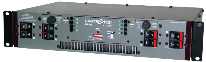
RE82 Rack Mount Dimmer

The RE82 is an 8 channel rack mount dimmer with a maximum capacity of 2,400 watts per channel giving a total of 19,200 watts. It is suitable for church, stage, theater, school, night club, live performances and other event and artistic applications.